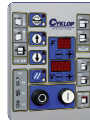
Control panel easy-to-use. Version features simplified operation. Multifunction programmable control panel.