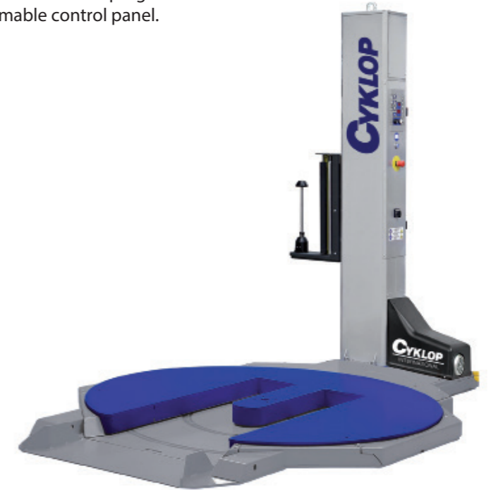
Version HS (Horse Shoe).